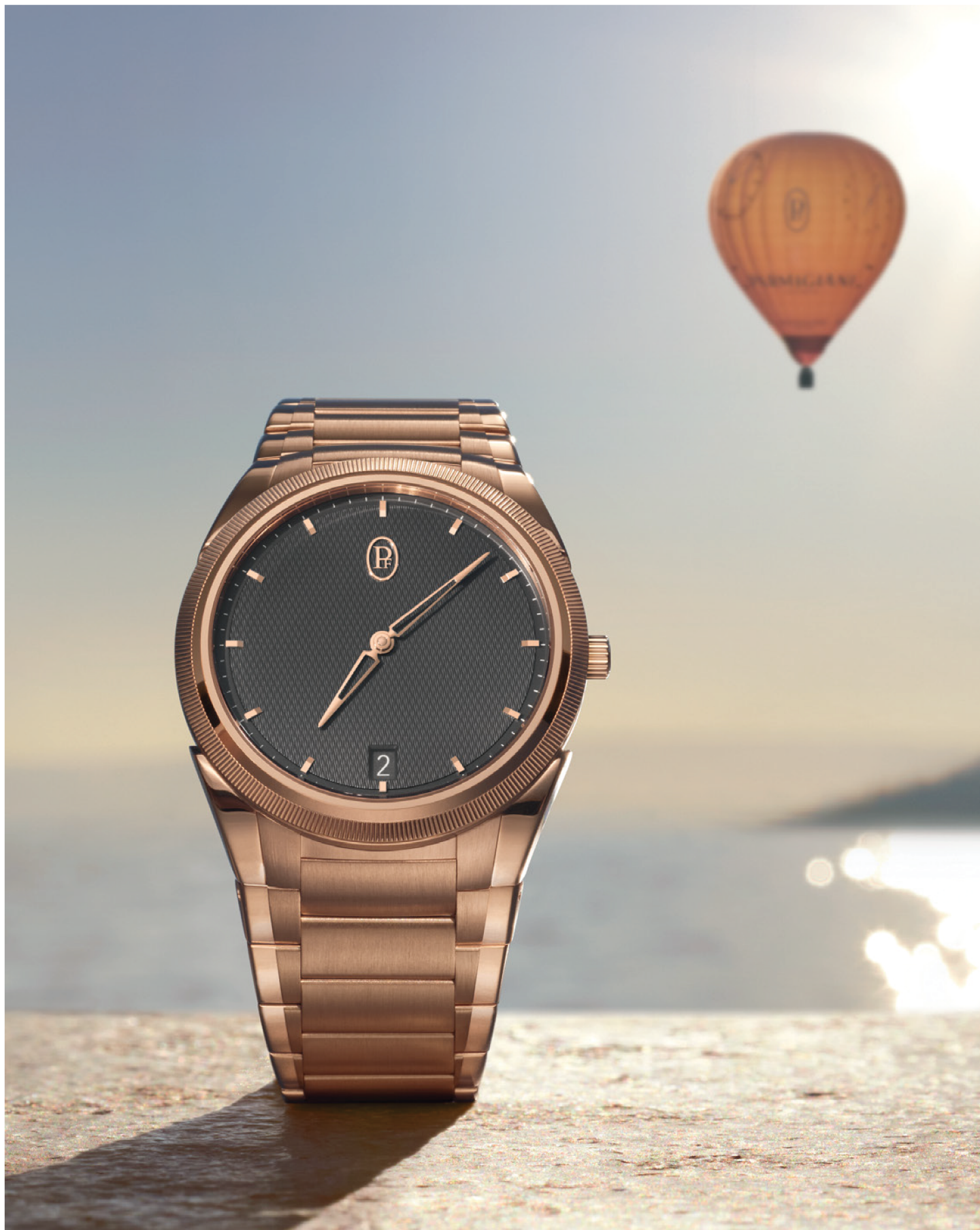
TONDA PF MICRO-ROTOR GOLD