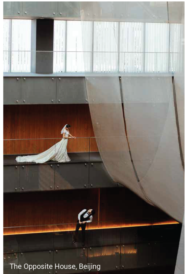
The Opposite House, Beijing

Next door to the 100-key hotel and 42 service residences is the 1,000-year-old Daci Temple. The Temple House's bamboo-tree shielded courtyard, constructed during the Qing Dynasty, completes its contemporary-meets-classic aesthetic. Likewise, wedding events here can be as grand as a dinner at The Hall, a ballroom with capacity for 150 banquet guests. Bitieshi, the hotel's restored courtyard building with three meeting suites, is best suited as a setting for wedding celebrations with a touch of history, while The Penthouse, located on levels 11 and 12, spans 287 square metres and is all